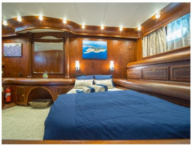
Gulet Alba - photos